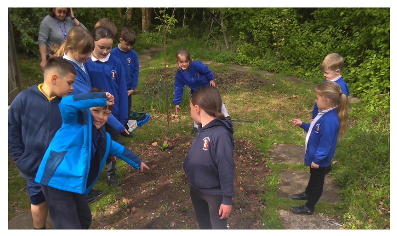
Pupils enjoying Gardening club.