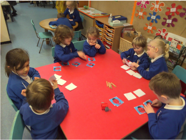
Cygnets have been learning about numbers to 8. They played a fun matching game where they used their counting skills to count the spots on ladybirds.

Swan class investigated which material was best for a lego house roof. The children are using some amazing scientific language.