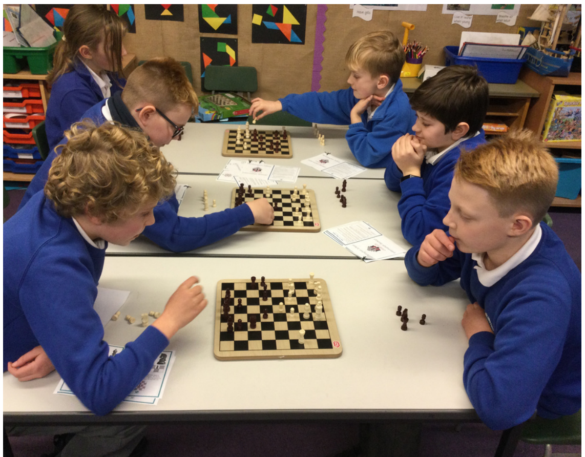
Year 1 to 6 enjoying Chess Club.