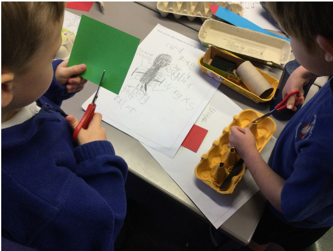
Swan class designed, made and painted egg box dragons!