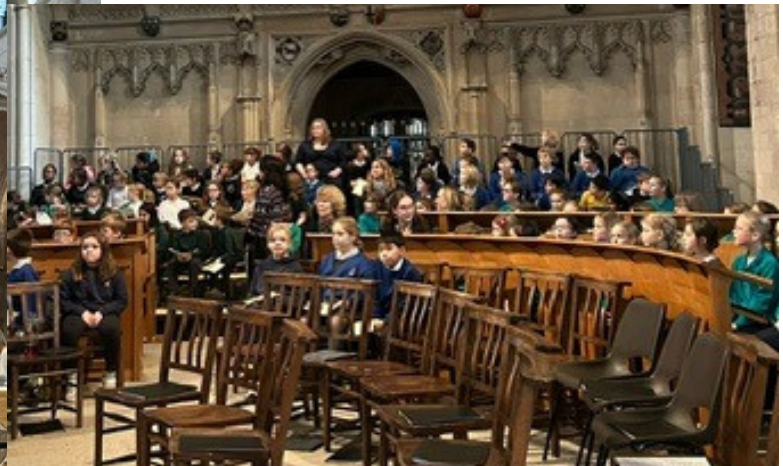
School Choir taking part in the Trust Carol Service

Kingfishers have used cross-stitch wonderfully to make these fantastic festive bookmarks.