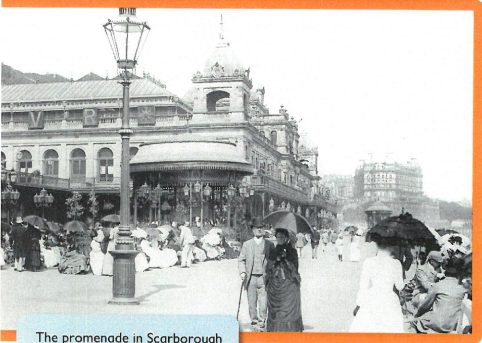
The promenade in Scarborough one hundred years ago.

Long ago families walked along the promenade . This is the path along the seafront. Here they listened to a band or relaxed in deckchairs. There were also funfairs and merry-go-rounds.