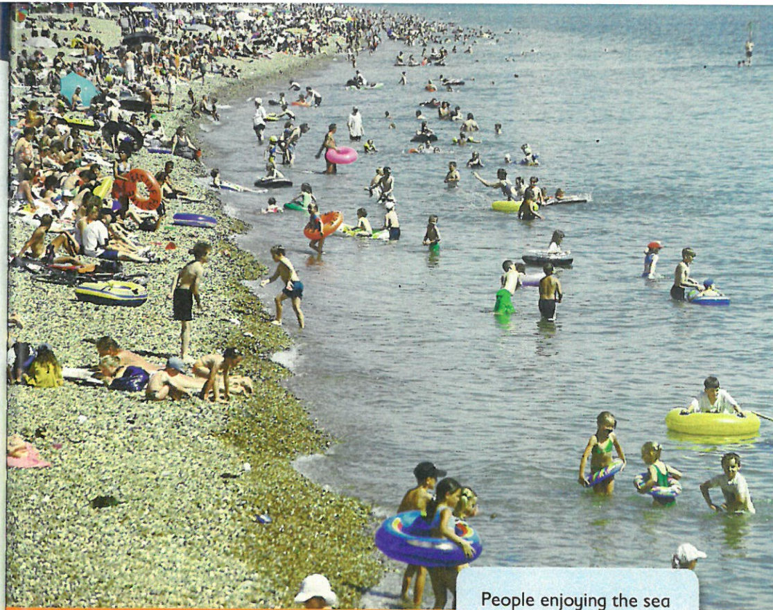
People enjoying the sea and the beach today.

For more than a hundred years children have watched Punch and Judy shows and enjoyed donkey rides on the beach. Sometimes you can still find these at the seaside today.