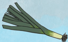
Onions, capsicums, leeks and garlic